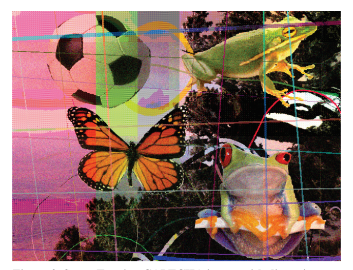
Figure 2. Scene Tagging CAPTCHA image with distortion.