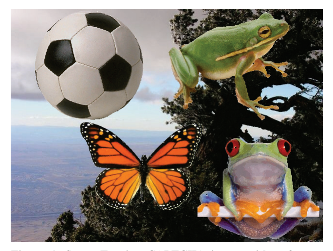
Figure 1. Scene Tagging CAPTCHA image with a frog, a second frog, a butterfly, and a soccer ball present.

Relative Spatial Location: In this type of question, a user must identify and determine the relative spatial location of the objects present in the test image. An example that might accompany figure 1 is "Name the object that is directly to the upper-left of the butterfly", to which the answer would be "soccer ball". Care is taken by the system to only generate questions to which there exists a clearly correct answer, avoiding questions which may cause confusion due to the existence of multiple reasonable answers.